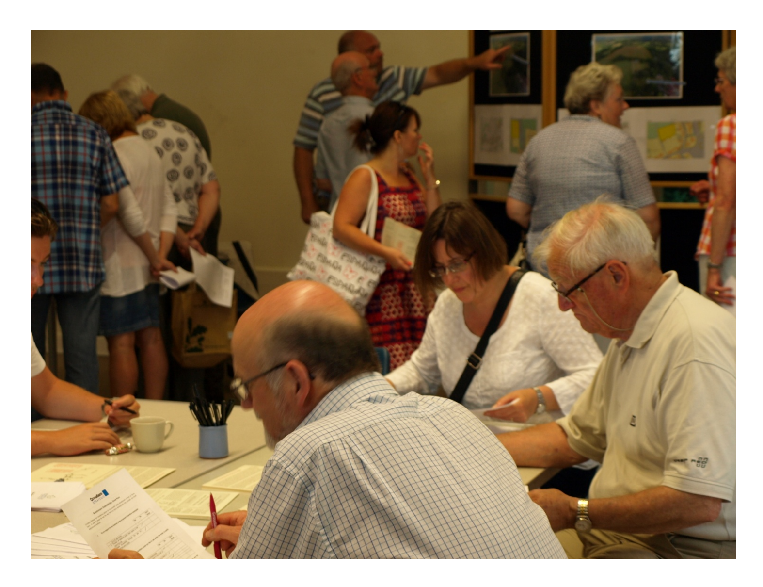
People at July 2015 Exhibition